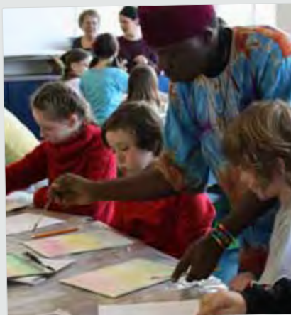
Multicultural Arts Residential in Conway