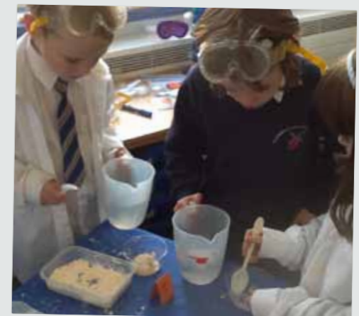
Future Einstein in the making!

"Our son has experienced a wide range of activities throughout the year which has boosted his confidence, and given him some great experiences"