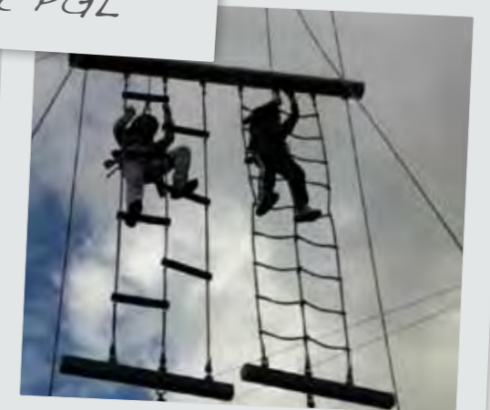
The PGL Experience