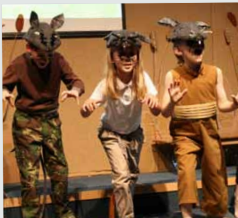
Another great performance!

"The team, parents and the children live and breathe these values and they result in a happy and welcoming school that provides high quality education and care." - Investors in People, Gold Award, October 2012-11-22