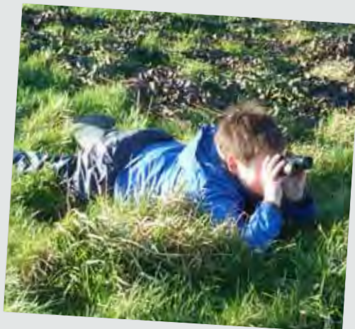
On the look out at Forest School

Neston Road Willaston Neston Cheshire CH64 2TN