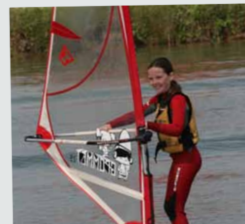
Windsurfing at Manley Mere