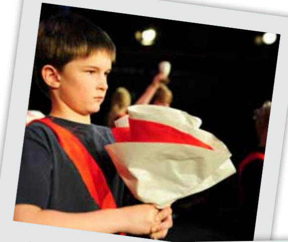
Performing Hamlet at Royal Exchange theatre

At present we run five residential visits in the school year for pupils from year 2 through to year 6.