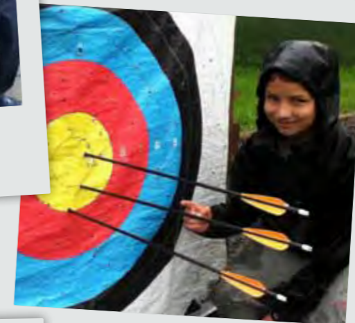
Archery at PGL