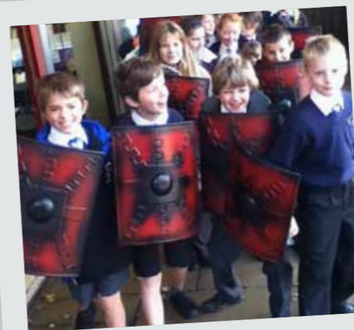
Being a Roman Soldier in Chester