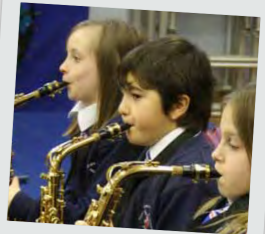
Budding musicians encouraged.